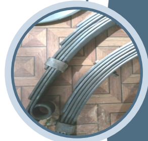
Heavy weight Kamani